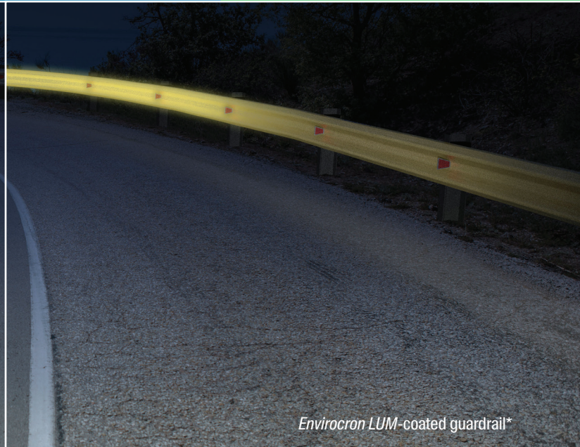
Envirocron LUM-coated guardrail*